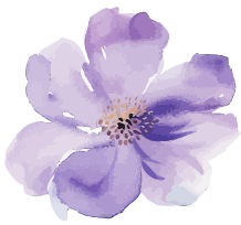
A purple flower