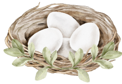
A bird's nest